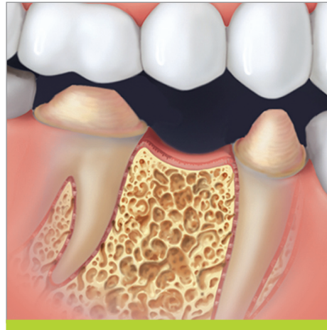
Two healthy teeth must be ground down to anchor the bridge.

Bridges can be less expensive than dental implants in the short term. However, the life span of a bridge is typically less than that of an implant. Also, the adjacent teeth that were prepared can be more susceptible to future problems, like decay.